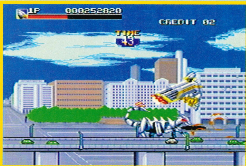
● Remember this scene from the film? That was all nicely rendered on powerful computers, but sadly this bit is very basic.