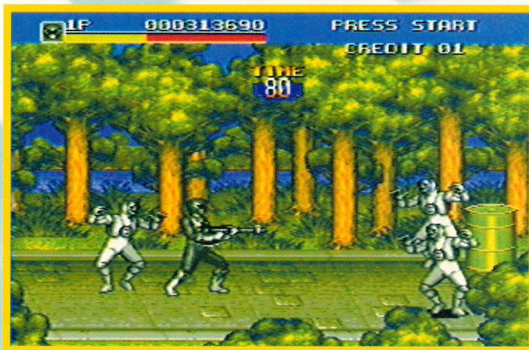
● They don't just use their feet and fists. No, the Power Rangers have pretty powerful guns, which would do a much better job against those putty things.