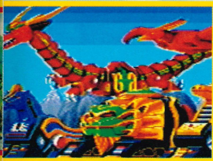
● These still pics are pretty good, showing off the new Zords rushing to aid the Power Rangers, which is a common sight in the TV series. Not that I watch it or anything!