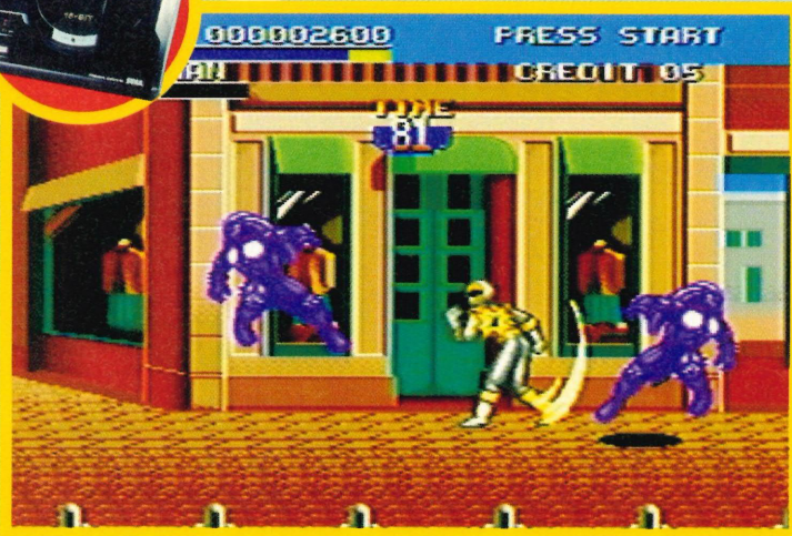
● The yellow ranger encounters the blue goopy minions of Ivan Ooze in the high street. Get used to seeing these, because they just keep on coming.