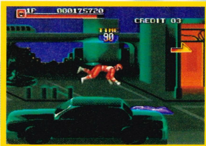
● Cars also pose a problem for the Power Rangers, but they're easy to avoid and don't exactly go very fast.