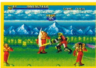
● This is another one of the boss sections where the player takes control of a MegaZord. It's better than the normal sections anyway.