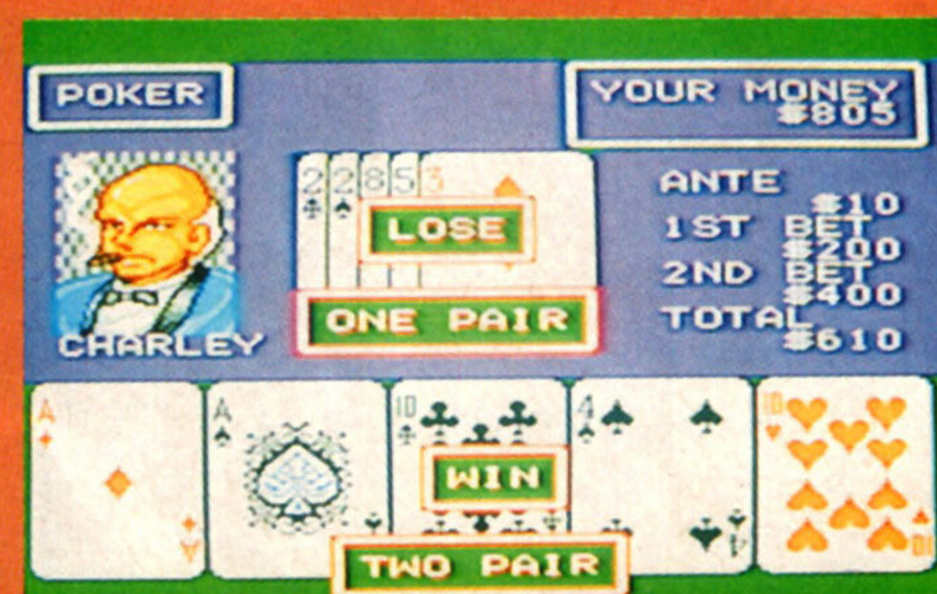
So, you've decided to play poker, and chosen Charlie as your opponent. A skillful bit of playing and Chaz is $205 short and looking a bit glum!