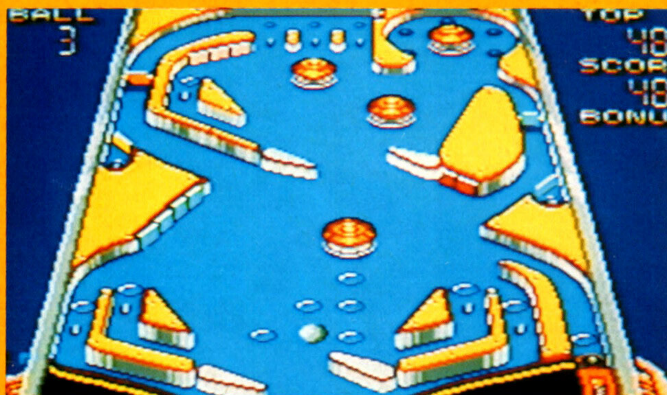
The pinball table provides a swift way of spending your cash.

from a typical spring-loaded plunger. This constantly moves in and out, and the ball is catapulted into play by pressing button 1, with