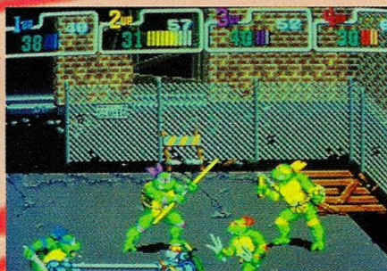
Fight to keep the streets safe!

With even more detailed graphics scrolling by as the backdrop to the action, Teenage Mutant Ninja Turtles introduces the familiar "gang-play" game mechanics that let you and your friends take on the enemy as