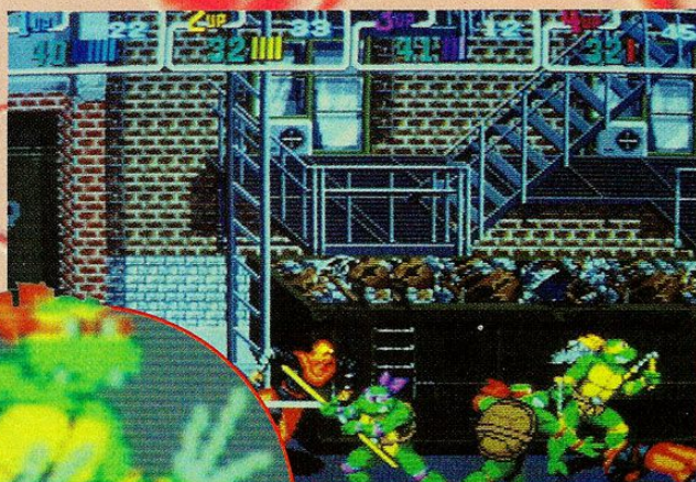
Take to the streets to defeat Shredder's evil clan!

one lean, mean and very green fighting machine!