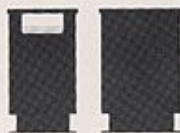
Slimline 35"H x 19"W x 22 \frac{1}{2} "D 89cmH x 48cmW x 57cmD 120 lbs./54 kg.