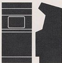
Upright 25 \frac{1}{2} "W x 67"H x 28"D 64.77cmW x 170.18cmH x 71.12cmD 290 lbs./132 kg.