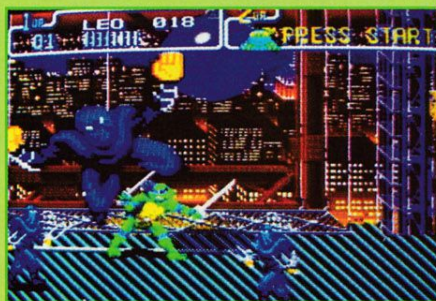
LEVEL ONE - MANHATTAN AT MIDNIGHT