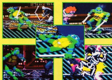
MANY WAYS TO DIE!