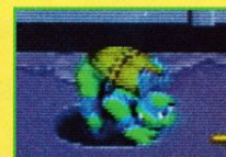
WATCH OUT FOR MANHOLES!