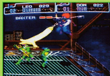
BOSS ONE - BAXTER