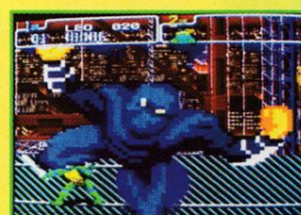
AWESOME MODE 7 SCALING!!!