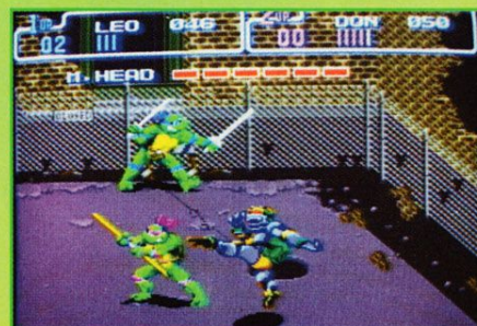
BOSS TWO - MECHATURTLE MORE TURTLE POWER!