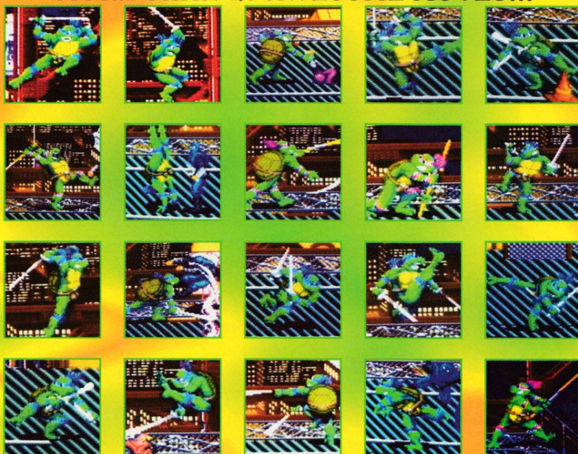
MORE THAN 20 AWESOME MOVES!!!

With the added power of 16-Bit technology, Konami brings the Turtles to life with colorful graphics, awesome animation and incredible sound. One of our favorite moves is the one you see to the left. You can actually hurl an enemy into the foreground of the screen thanks to great Mode 7 scaling. All in all, this is the best Turtles adventure yet, and will be a hot game to watch for in the near future.