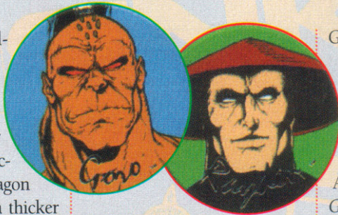
Mortal Kombat milk caps are all the rage.

The milk-cap furor can be traced back to Japan, but the caps are becoming the rage in the U.S. after a reintroduction in Hawaii. In the milk-cap game, each player puts in a certain number of caps, which are then stacked face down. Using a slammer, players successively strike the stack. Any face-up POGs are taken by that player until all POGs have been overturned. Many schools across the nation have outlawed the game as a form of gambling.