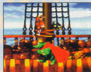
Donkey Kong Country made it to Time's Best of 1994 list.

The December 26 issue of Time magazine listed its prestigious Best of 1994 winners in several categories. In the category "Best Products," only one video game made the top-ten list: Coming in at number two, right behind the Chrysler Neon, was Donkey Kong Country .