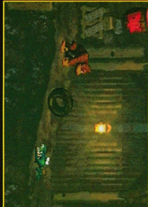
Necky The Vulture

At the end of the Monkey Mines level, the Boss to fight is Necky. Necky is a huge vulture that pokes his head on either side of the screen, usually at the top. As soon as he appears on the screen he will open his mouth and spit out a rather large nut. To destroy Necky, jump onto the rubber tire located in the center of the screen. This will give you some extra height so you land on top of his head.